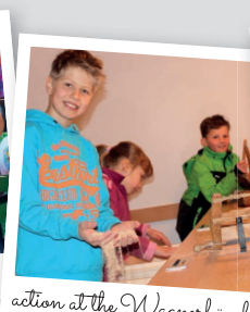
action at the Wagnerhäusl