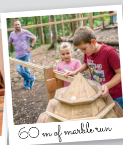
60 m of marble run

At the “ Wagnerhäusl ” our little visitors can actively get to know the profession of wagon-maker through play.