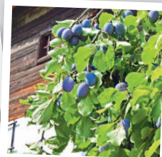
bountiful fruit crop