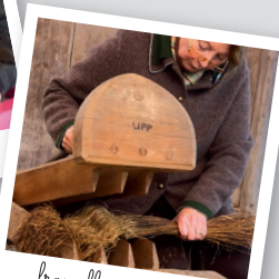
from flax to linen