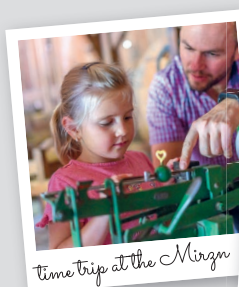
time trip at the Mirzn