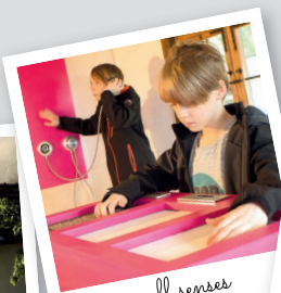
using all senses