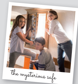
the mysterious safe

Children of all ages are invited to travel through time and crack a secret code in our “ house of discovery ”, where only those who use all their senses are able to solve the exciting mystery. There are activities for families to join in with every Saturday , free of charge.