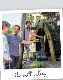
the mill valley