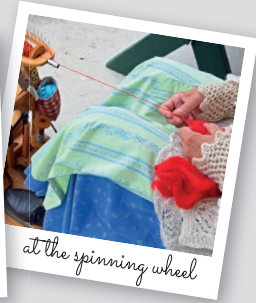
at the spinning wheel