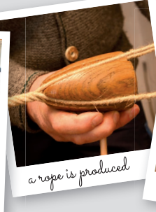
a rope is produced