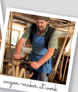
wagon-maker at work